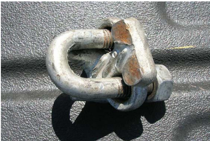
Remove the lugs on one side as shown