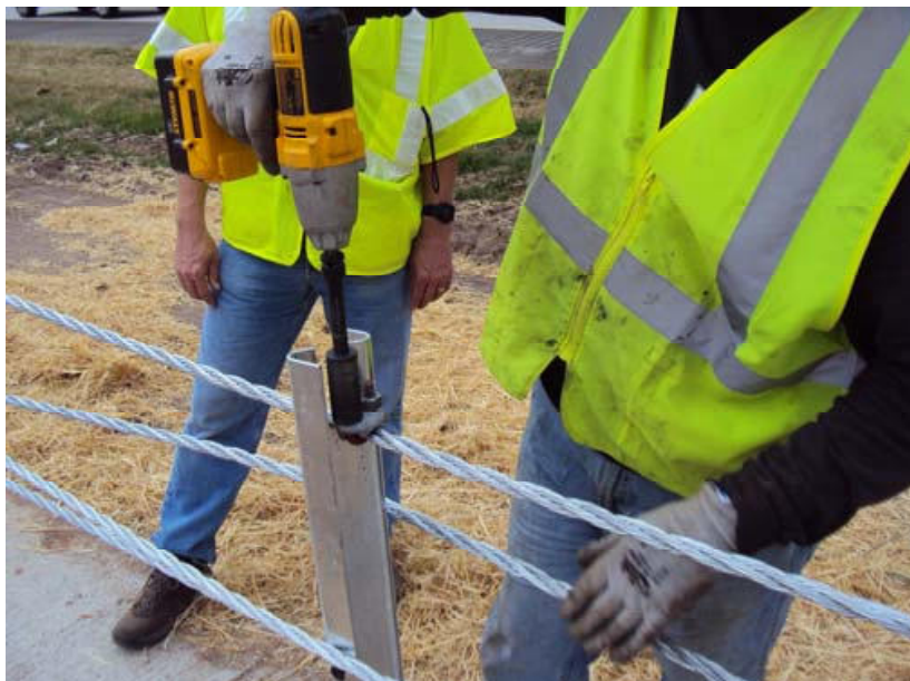
Tighten with an impact wrench or ratchet/socket